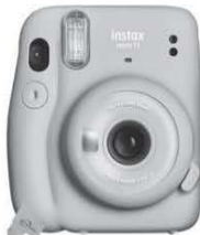
FUJI INSTAX CAMERA